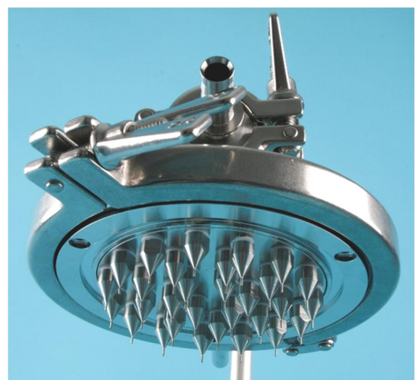
Head for 30 nozzles and customised nozzles

The unit is available in three versions: 24 and 30 nozzles.