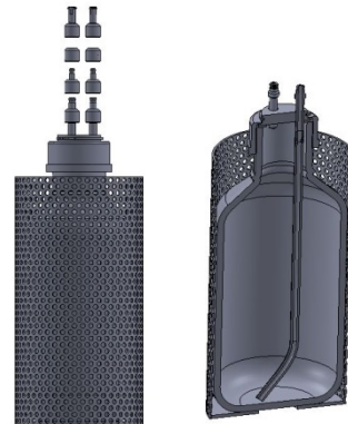
Flask with cover for large flowrate

The adapters for small hoses and blinds are also available for the cover.