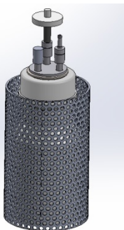
Standard flask connections

Certificate for pressure resistance: Acc. DIN ISO 1595, confirmed with GS-Sign (TUEV ID: 0000020716)