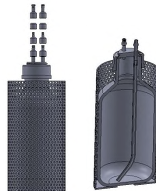
Flask with cover for large flowrate