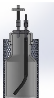
Standard flask with connections and safety basket